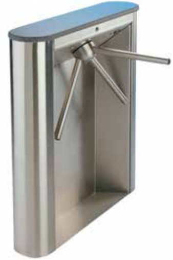
Waist High Turnstiles

Our waist high turnstiles and ADA gates can be found across the globe at top pro sports venues, embassies, universities and retail sites. From basic carbon steel tripod turnstiles to sophisticated stainless steel waist high turnstiles with wood laminate tops, we have a solution for all your needs. We offer portable turnstiles that can count (for convention centers and state fairs), coin and bill acceptor turnstiles for venues and border areas and, ticket storage turnstiles. We also offer matching waist high ADA gates to complete any turnstile installation.