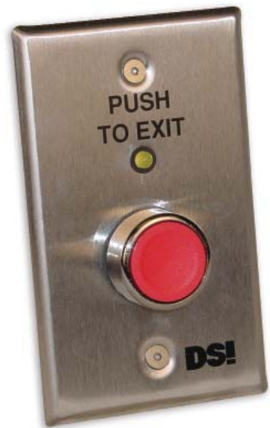
ES441 with Stainless Steel Plate

The ES440 Series of push button control units consist of button controlled devices for use in access control systems. Momentary, latching, and time delay relay (TDR) are available.