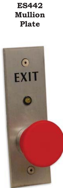
ES442 Mullion Plate