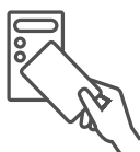
Card reader access